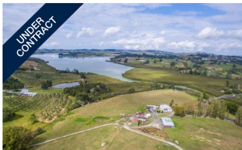
2423 State Highway 12, Papanoa Under Contract