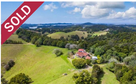
722 Ngunguru Ford Road, Glenbervie Sold Private Treaty

From one coast to another ... we have secured another prime coastal farm. 362ha at Linton Road, Maungaturoto, part of a 4 th generation family farm, consisting of a dairy, sheep and beef unit with three good homes and multiple titles. See page 2.